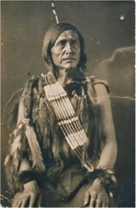
Chief Papaschase c. 1880's

guaranteed help from the government in the form of food, rights as a First Nation, medical assistance, tools, and a plot of land for the band. In exchange, they would give up their land (which, at this time, covered much of what we know to be downtown Edmonton) and be considered employees of the Hudson's Bay Trading company.