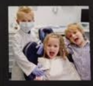
Children will feel right at home in our friendly atmosphere. Top of the line laser technology allows us to do most children's fillings without dental freezing!

Refer a friend for a chance to win great prizes!