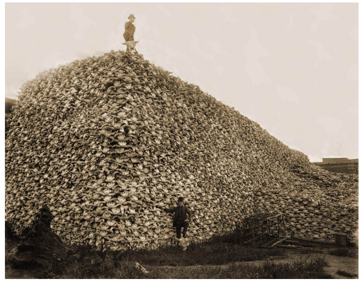
Hunters posing by a pile of bison bones in 1892. By the late 19th century, there were only 100 bison existing in the wild.

After nearly 100 years of being disbanded, the Papaschase have reformed and are now fighting for their official First Nations status. They were instrumental in the Idle No More Movement and in the creation of the Fort Edmonton Cemetery and Traditional Aboriginal Burial Ground in Rossdale. The remains of at least thirty-one Papaschase ancestors were recovered at the site. You can read more of the Papaschase story on their website,www.papaschase.ca.